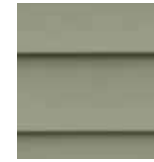
DOUBLE 4" IN CYPRESS