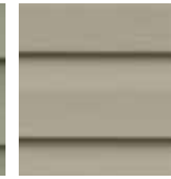
DOUBLE 4" DUTCHLAP IN CLAY